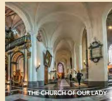
THE CHURCH OF OUR LADY