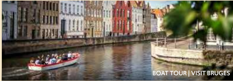
BOAT TOUR | VISIT BRUGES