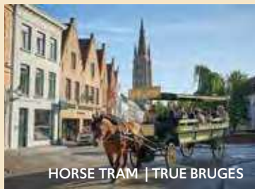
HORSE TRAM | TRUE BRUGES