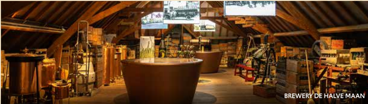
BREWERY DE HALVE MAAN