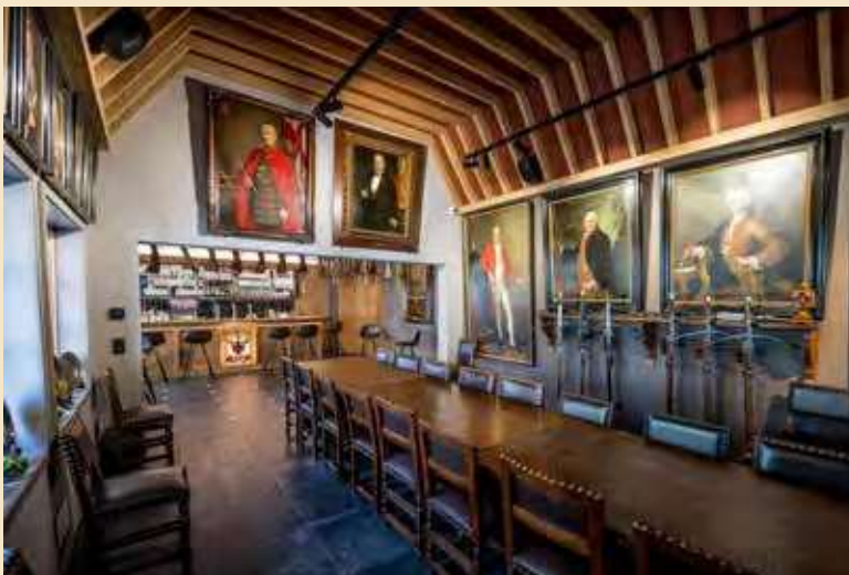
THE ST GEORGE'S GUILD