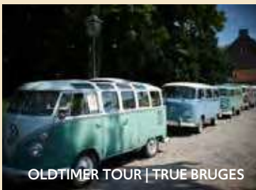
OLDTIMER TOUR | TRUE BRUGES