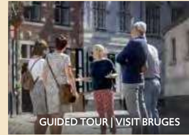
GUIDED TOUR | VISIT BRUGES