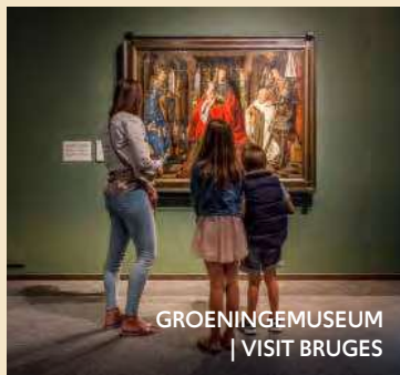
GROENINGEMUSEUM | VISIT BRUGES